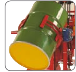
Available with optional extras, e.g. crane arm, drum turner, boom, remote control and level control.