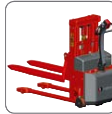
Hour counter, battery indicator and error finding in the same instrument. Motor brake.