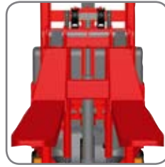
Adjustable carriage is standard.