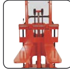
Adjustable forks are available in many different lengths and types.