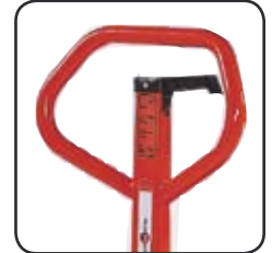
Ergonomic handle ensures the user a relaxed hold. The handle can be marked with the name/department.

Available with manual and electric lifting.