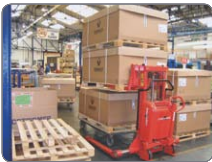
Strong construction ensures a long operating life and low maintenance costs.