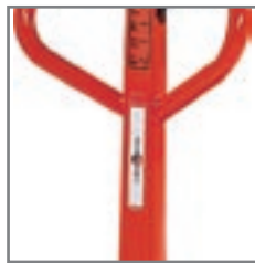
Can be marked with name/department.