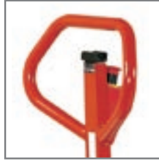
Ergonomic handle ensures the user a relaxed hold.