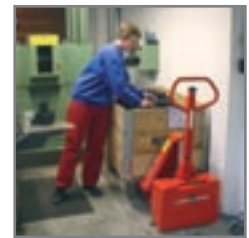
Patented cylinder construction gives low overall height.

We also offer tailor-made solutions. Please ask for further information.