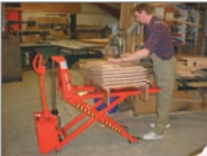
Optional extras: remote control, level control, brake, separate or built-in charger.