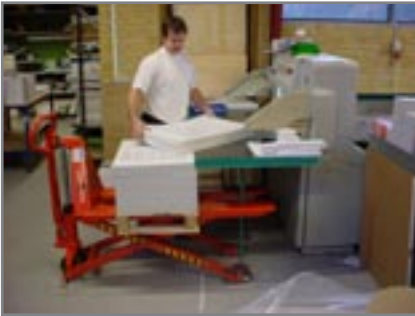
1,500 kg can be transported and lifted up to 400 mm. From 400 mm the lifting capacity is 1,000 kg.

The highlifter is available in manual, electric, stainless and explosion proof versions.