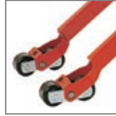
The tandem wheels have a brake effect and are not hostile to the floor.