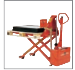
Level control (optional extra) ensures a constant working height.