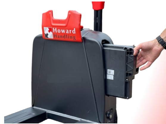
pull-out lithium ion battery weighs only 5kg