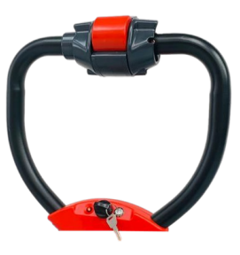
simple, user friendly controls