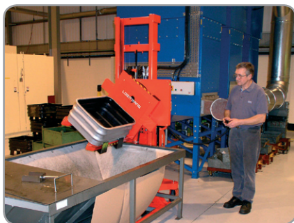
Available with side-tilting forks and/or optional extras, e.g. drum turner, crane arm, spear, remote control, level control.

***** Tests show that 1700 mm are enough.