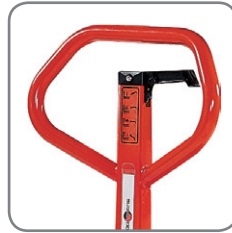
Ergonomic handle ensures the user a relaxed hold. The handle can be marked with the name/department.

Strong construction ensures a long operating life and low maintenance costs.