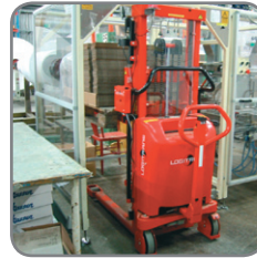
High manoeuvrability: Short overall length, large turning angle, assisted steering and low own weight.