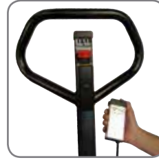
Remote control for the tilt function.