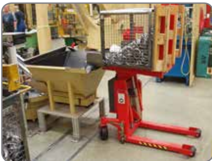
The Logitilt being used in the component industry.