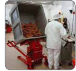
Perfect working position when emptying boxes and crates - sitting as well as standing.