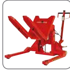
The straddle Logitilt can handle many different pallet types, also closed pallets.

Strong construction ensures a long operating life and low maintenance costs.