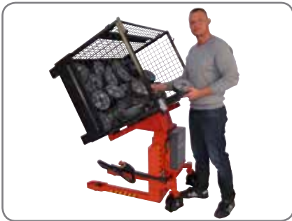
The handle can be turned to the side, so that the user has free access to the contents of the crate or box.