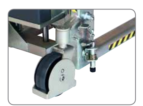
Foot protectors, parking brake, safety valve and emergency stop offer the operator optimum safety.