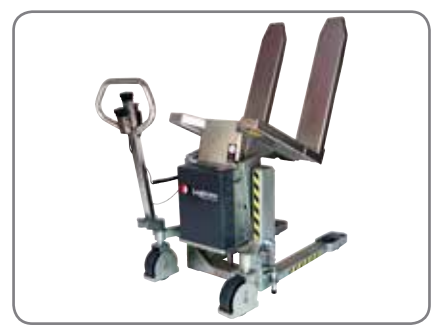
For the food industry in which hygiene and ergonomically correct working positions are important factors.