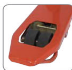
With twin fork wheels it is very easy to change direction