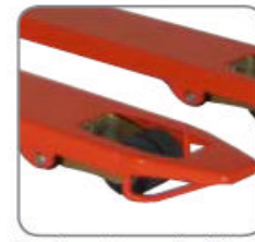
The hoop skates on the forks ensure an easy fork insertion and withdrawal in/out of pallets