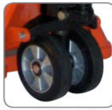
The special rubber wheels are gentle to floor and flagstone layer and also have anti-static qualities