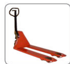
Panther Silent has permanent quick-lift