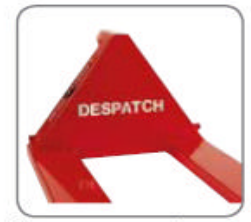
A company name or logo can be cut into the A-frame (optional extra)