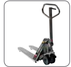
Strong construction ensures a long operating life and low maintenance costs.