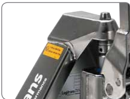
The explosion proof trucks are suitable for the pharmaceutical, chemical, oil, gas and paint industry.

II 2G Ex h IIB T6 Gb II 2D EX h IIB T85°C Db