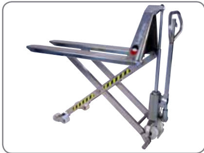
The standard trucks are manual and made of stainless steel.

The explosion proved construction is characterised by the following product mark: