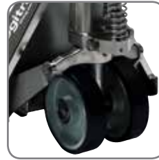
The trucks have two vulkollan anti-static wheels in order to conduct away static electricity.