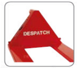
A company name or logo can be cut into the A-frame (optional extra)