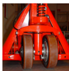
Service brake (hand operated) with Vulkollan steering wheels