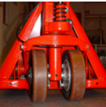
Vulkollan steer wheels on Service Brake