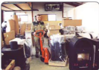
Easy handling of goods is ensured even in very confined spaces