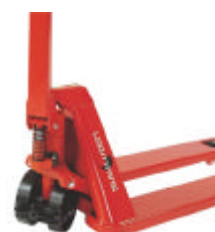
Parking brake (foot operated)