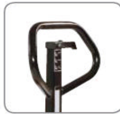
Ergonomic handle ensures the user a relaxed hold. Can be marked with name/department.