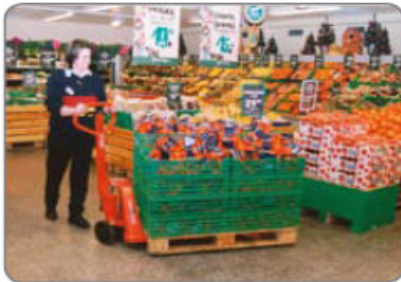
Adjustable fork height – no problems when handling low and worn pallets