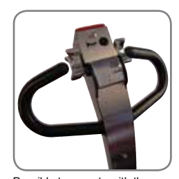
Possible to operate with the handle upright. Central location of all control buttons.