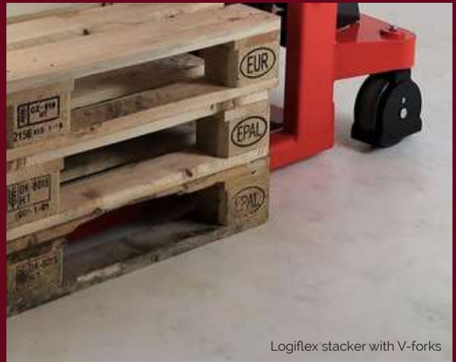
Logiflex stacker with V-forks