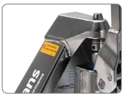
The explosion proof trucks are suitable for the pharmaceutical, chemical, oil, gas and paint industry.

II 2G Ex h IIB T6 Gb II 2D EX h IIIB T85°C Db