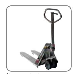
Strong construction ensures a long operating life and low maintenance costs.