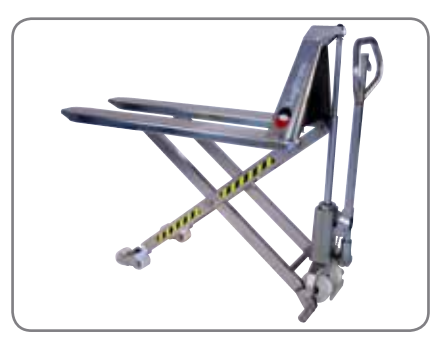
The standard trucks are manual and made of stainless steel

The trucks are categorised in equipment group II and are suitable for areas classified as zone 1/zone 21 (do also cover zone 2/zone 22). This means areas, in which an explosive atmosphere is generated occasionally due to different gases or dust.