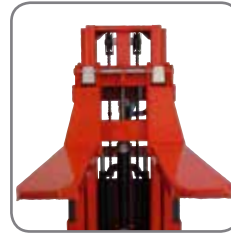
With the quick shift system, it is easy and quick to carry through exchange between forks and optional extras.