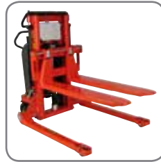
The forks can be fitted on all Logiflex models with and without straddle legs.

Chisel forks: Thin forks for low heights under the load to be raised.