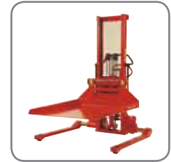
Quick shift options: Crane arm, boom, platform, reel spindle, reel clamp and drum turner.