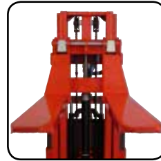
Adjustable forks are available in many different lengths and types.