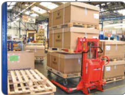
Strong construction ensures a long operating life and low maintenance costs.