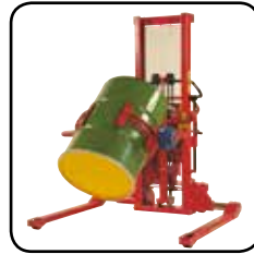
Available with side-tilting forks and/or optional extras, e.g. drum turner, remote control, level control, crane arm.