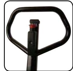
Ergonomic handle ensures the user a relaxed hold. The handle can be marked with the name/department.

Available with manual and electric lifting.