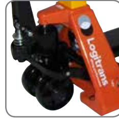
The turning angle of BFC6-7 is 210°, ensuring easy operations in confined areas.