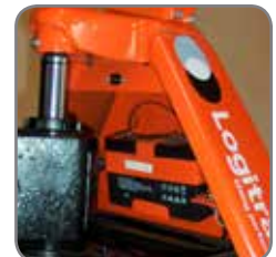
Built-in charger with an easily accessible charger plug.

Please ask for further information or visit our website www.logitrans.com