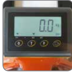
The BFC6-7 has tare and zero setting, and can show kg or lb.