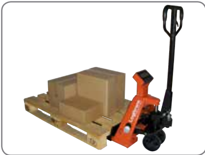
The BFC6-7 transports and weighs goods in the same work procedure.