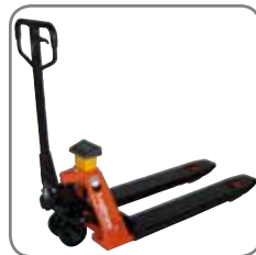
Accurate weighing results with four built-in weighing cells.