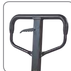
Rubber covered handle ensures a comfortable hold.