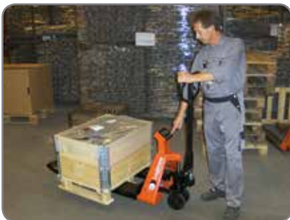
The ideal weighing system – solid, accurate and easy to use all over the company!