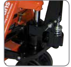
Reliable leak-proof hydraulic system.