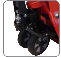
Reliable leak-proof hydraulic system.