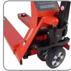
The turning angle of WSP 2200 is 210°, ensuring easy operations in confined areas.