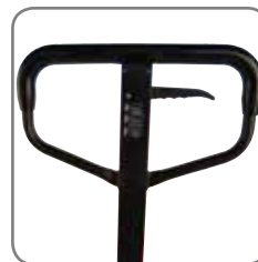
Rubber covered handle ensures a comfortable hold.