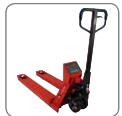
Solid, accurate and easy to use all over the company.

Please ask for further information or visit our website www.logitrans.com