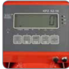
WSP 2200 has tare, counting and zero setting.