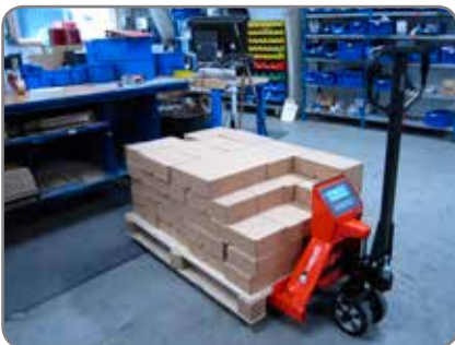
Sound or light indication, when reaching requested weight.