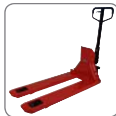
Accurate weighing results with four built-in weighing cells.