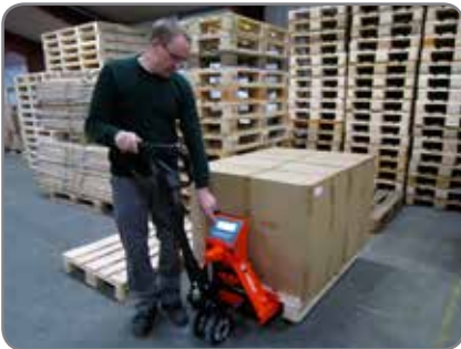
WSP 2200 transports and weighs goods in the same work process.