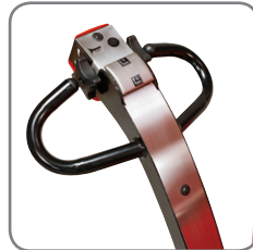
Possible to operate with handle upright. Central location of all control buttons.