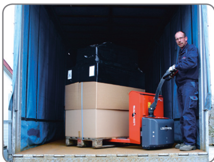
Panther Maxi (capacity 1800 kg) is recommended for heavy pallet transport, e.g. in the transport industry.