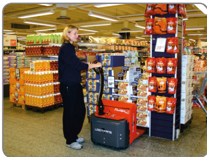
Panther Mini (capacity 1400 kg) is recommended for easy pallet transport, e.g. in super markets and in stock areas.