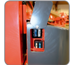
Easy access to all components makes service of the truck straightforward.