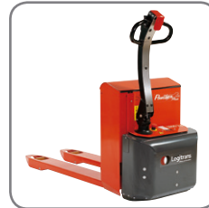
Strong construction ensures a long operating life and low maintenance costs.