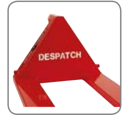
The company name or logo can be cut out in the triangle of the Panther.