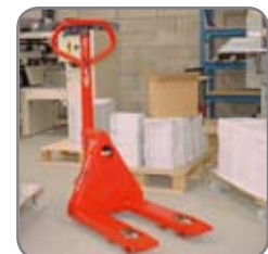
Panther is available with different fork lengths.

We also offer tailor-made solutions. Please ask for further information or visit our website